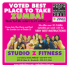
Studio Z Fitness