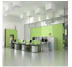
All American Office Cleaning

The light emitted by random lasers could also enable faster image generation. This would help researchers and clinicians better capture fast-moving physiological