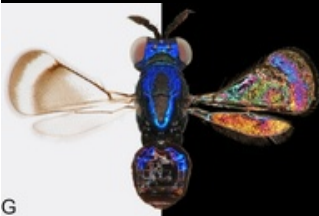
G Gallery of Colorful Wings